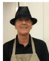
Bex School cook