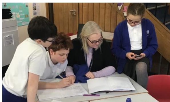
← The science boffins crunch the numbers to work out the results

Also linked to their science work, Year 5 and 6 recently conducted experiments to investigate whether the size, shape or material of a parachute affects the time it takes for them to fall. Perhaps they should share their findings with our near neighbours at RAF Benson?!