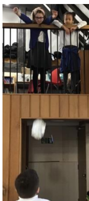
↑ Testing their parachutes

Also linked to their science work, Year 5 and 6 recently conducted experiments to investigate whether the size, shape or material of a parachute affects the time it takes for them to fall. Perhaps they should share their findings with our near neighbours at RAF Benson?!