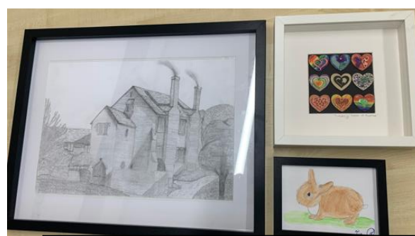
Some early contributions for the art sale

As part of this project we have been challenged to raise money and have decided to do this by holding an art sale in school on Thursday 21 st and Friday 22 nd March , from 3pm. The children, and adults as well, are invited to submit works of art for the sale. We have already started to receive some contributions from both children and adults.